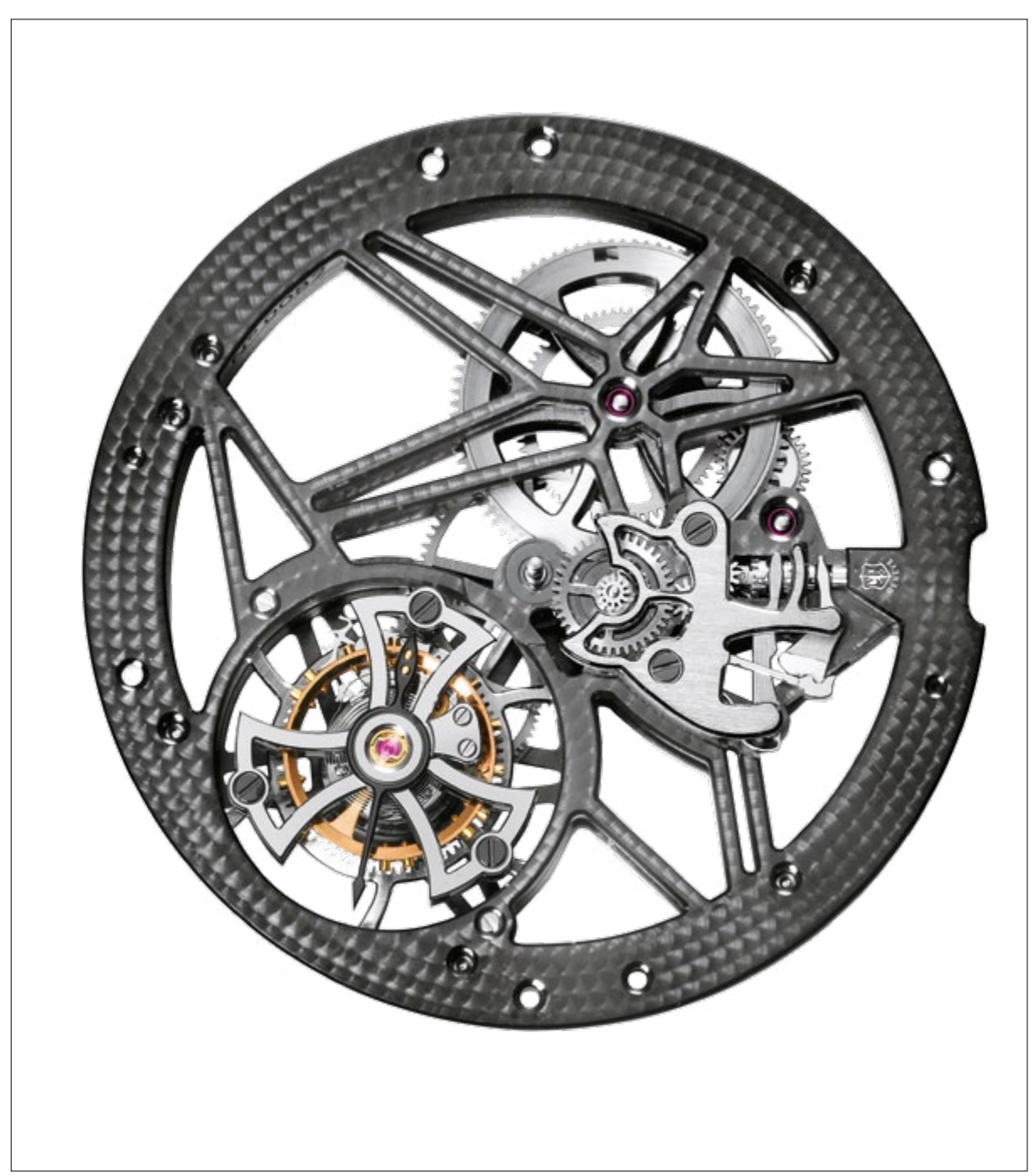
RD505SQ: Exclusive in-house Skeleton Flying Tourbillon Calibre

In recent years, the Manufacture Roger Dubuis has carved out an undeniable niche for itself in the field of skeleton calibres. Consistently mingling aesthetic and technical factors, they bear the imprint of an approach based on designing these skeleton calibres right from the word go rather than merely skeleton-working existing movements. This gives the designers considerable creative freedom – and keeps the developers busy overcoming the challenges involved in ensuring that the mechanical functions fit the requirements of the design. Epitomising this attitude of merging formal aesthetics with useful functionality, the instantly recognisable star shape of Roger Dubuis contemporary skeleton movements, borrowing from the skeleton-work motifs seen in nature such as in heavenly constellations, frequently involves the tips of said stars pointing to the hour-markers and thus enhancing clarity.