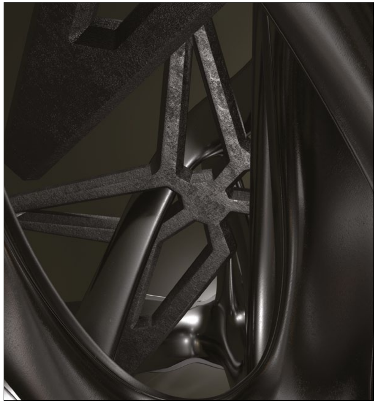
Once upon a time in the constellation of Horologia...

For the SIHH 2015, Manufacture Roger Dubuis is to stage another scenographic surprise designed to stun and intrigue visitors to the exclusive annual watch show. Inspired by an eclectic range of sources including fashion, architecture, painting, sculpture and film-making, the Roger Dubuis booth will embody a dreamlike fantasy world powerfully evoking the Manufacture's primary theme of the year: skeleton-work and its multiple interpretations in nature, art and watchmaking.