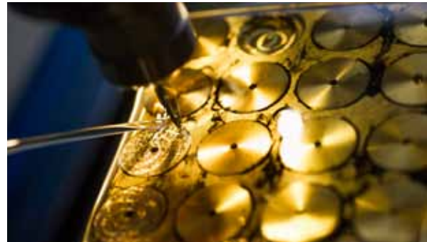
Manufacturing of the decor of the barrel drum, with a digital machine.