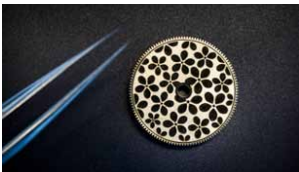
The barrel drum is decorated with a floral pattern; a craftsmanship involving ten different operations.