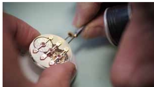
The Three gold Bridges' movement with its barrel decorated.