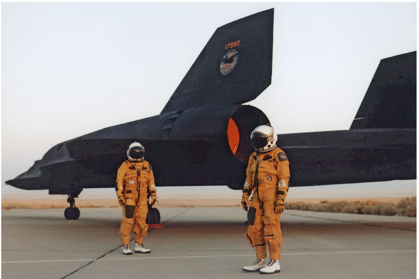
SR71 BLACKBIRD © NASA

Ever since it was founded, Bell & Ross has made aviation, and more specifically aeronautical instrumentation, one of its main sources of inspiration, both in terms of design and technology. This new watch represents the convergence of all the values of Bell & Ross. Vintage in style, the new BR 126 BLACKBIRD stands out as decidedly modern with its advanced technology and high quality finish. Offering a Flyback function characteristic of the very best aviation chronographs, it pays tribute to the Lockheed SR-71 "Blackbird", the legendary American plane.