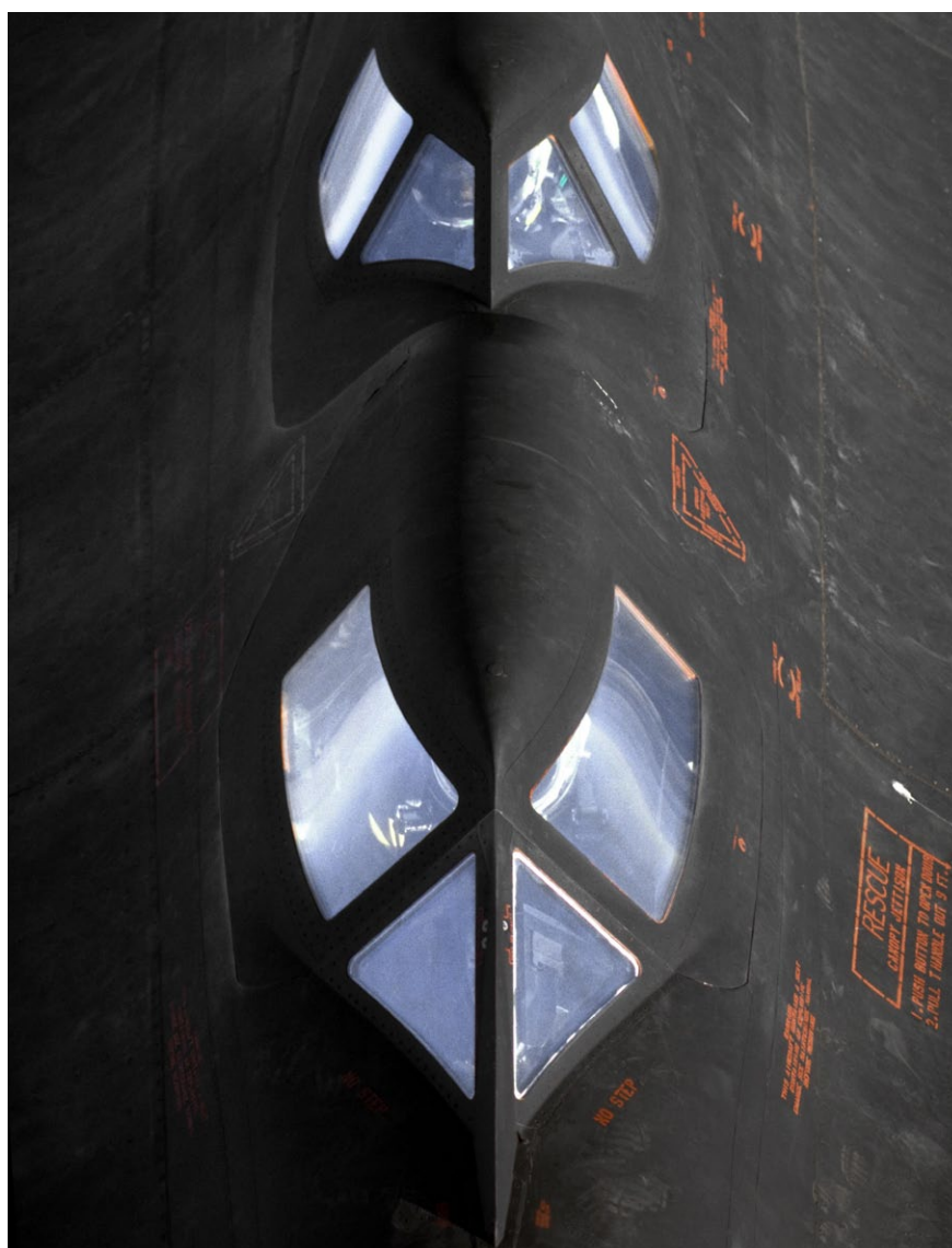
SR71 BLACKBIRD